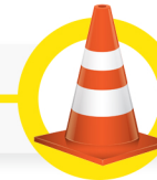
SHARED WORK ZONES