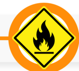
COMBUSTIBLE MATERIAL STORAGE