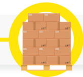
TEMPORARY MATERIAL STAGING AREAS