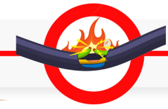
DAMAGED ELECTRICAL LEADS