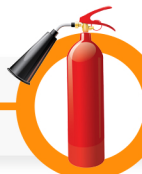
FIRE EXTINGUISHER ACCESS