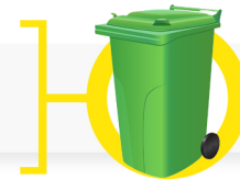
WASTE COLLECTION POINTS