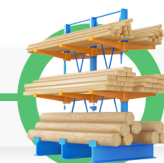
APPROVED STORAGE ZONES