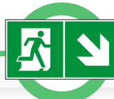
EMERGENCY ACCESS ROUTES