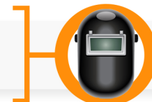
HOT WORKS ZONES